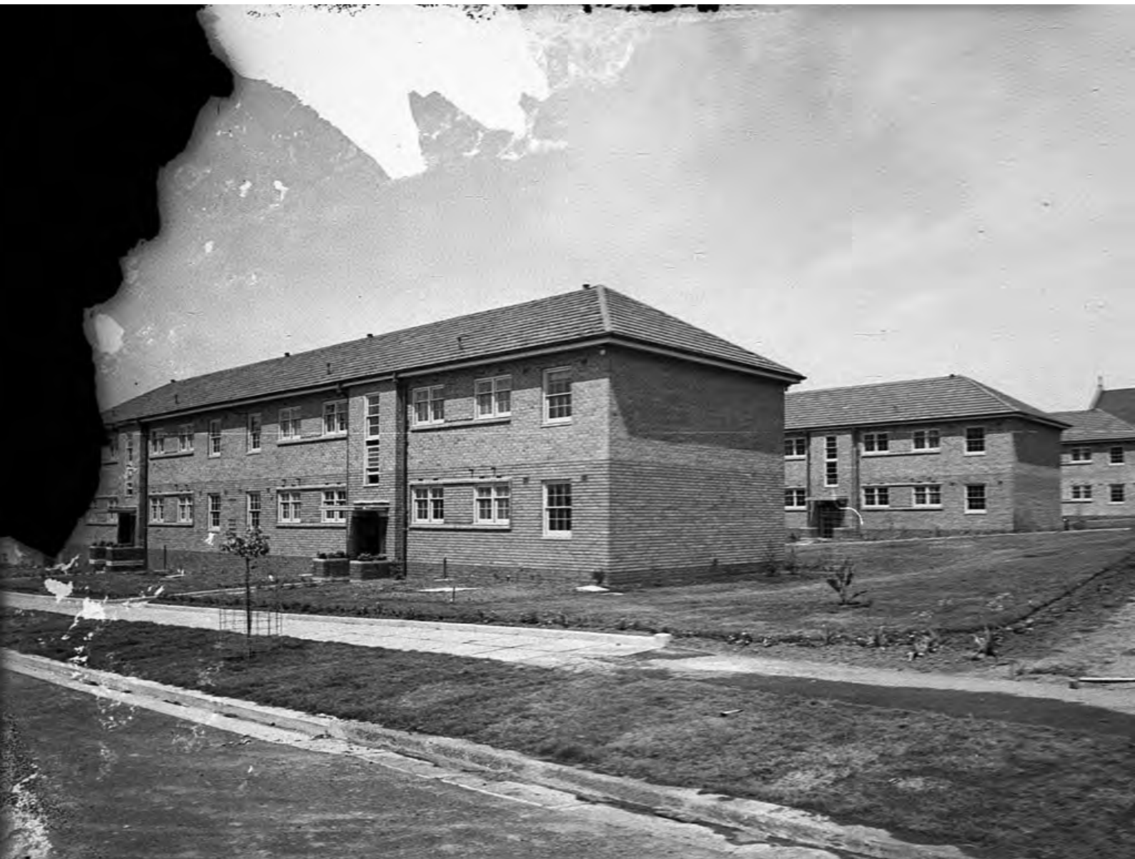
Erskineville Housing Scheme, 1938