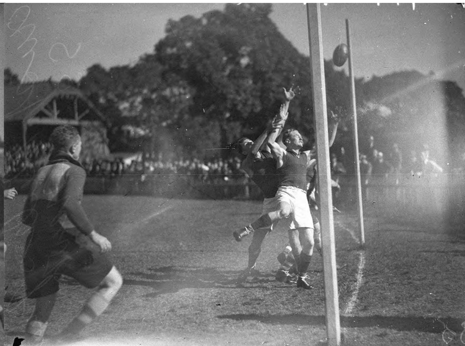
Interstate tramways Australian Rules Football Carnival, 1934, Hood Collection part I : Sydney streets, buildings, people, activities and events, ca. 1925-1957, Mitchell Library, State Library of New South Wales