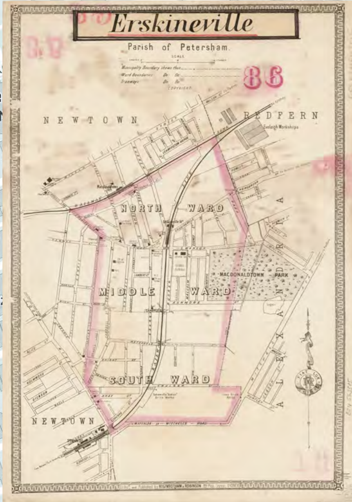
Parish of Petersham, lithographed & published by Higinbotham & Robinson, 1888