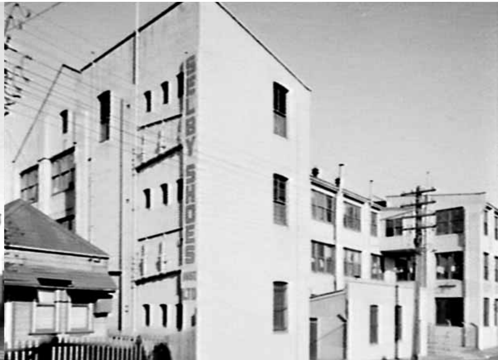
Selby Shoe Factory, 1954, Prospect Street, Erskineville