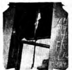
A window in the house in Union-street, Newtown, that suffered during the fight to-day.

In the excitement of the battle, an onlooker, a man aged about 40, whose name is not yet known, had a fatal seizure. The Newtown Ambulance reported that fourteen anti- evictionists and twelve police were injured. All were treated at the Royal Prince Alfred Hospital. Eighteen men were arrested.