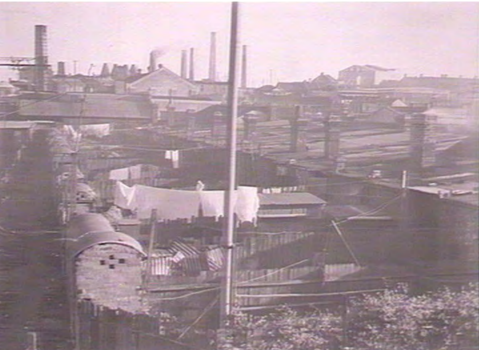
Resumed properties, Erskineville, 1937, courtesy Mitchell Library , State Library of New South Wales