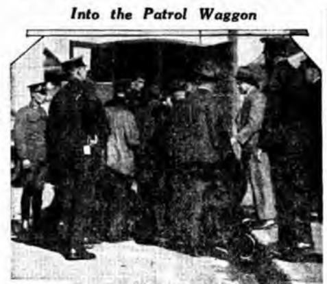
Police handling arrested men into the patrol wagon after to-day's clash between police and anti- evictionists at a house in Union-street, Newtown.